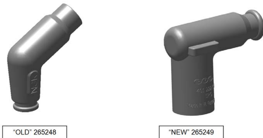
Fig. 2 Spark plug connector